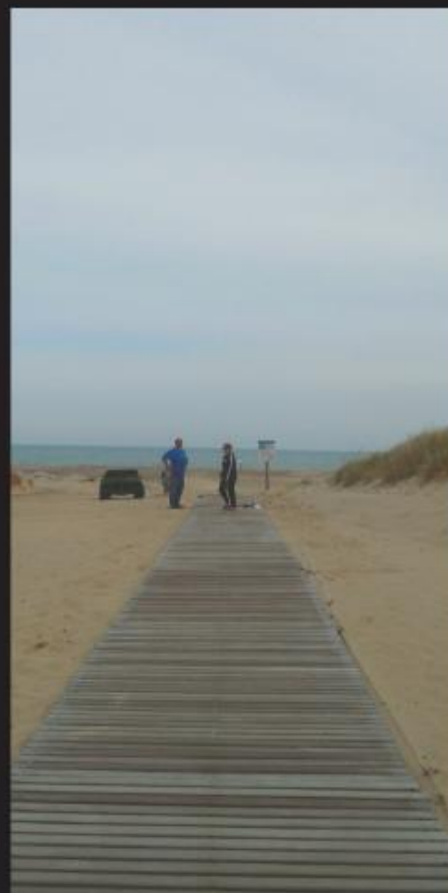
City crews install the beach walk in anticipation of sunny skies.